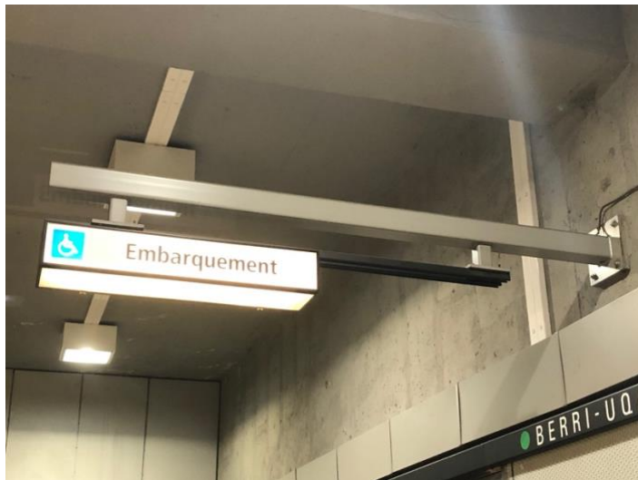
Illustration 6 - Boarding indication, disabled access