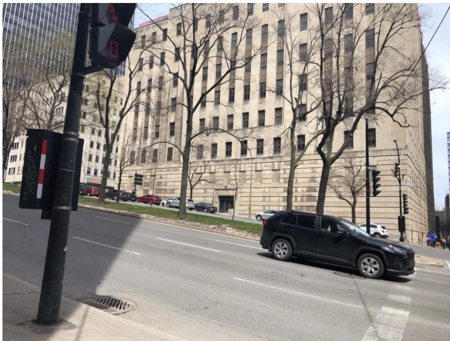
Illustration 1 - Some streets have very steep slopes

The streets of the city of Montreal are very often sloping. If you are a user of mobility aids such as a manual wheelchair or walker, you may need assistance or consider options other than walking. Travel times and options are given as a guide.