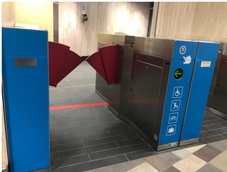
Illustration 8 - Disabled access gate