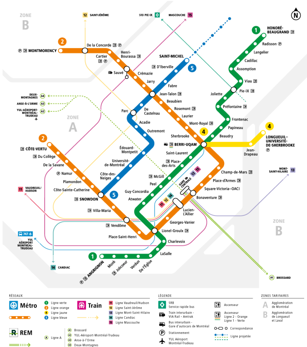
Illustration 4 - Montreal metro map

https://www.stm.info/en/info/service-updates/elevators