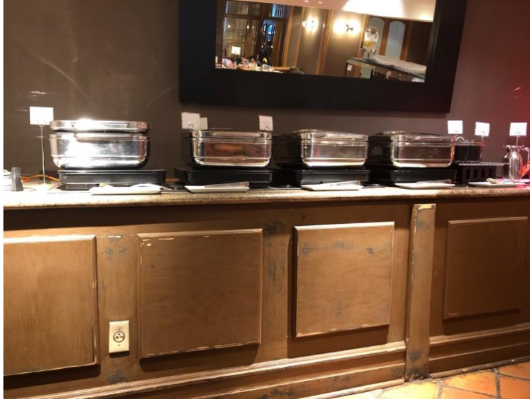
Illustration 15 - Breakfast buffet, everything is elevated

The same room is also a restaurant (Milton). The main room is directly accessible and does not require you to change levels.