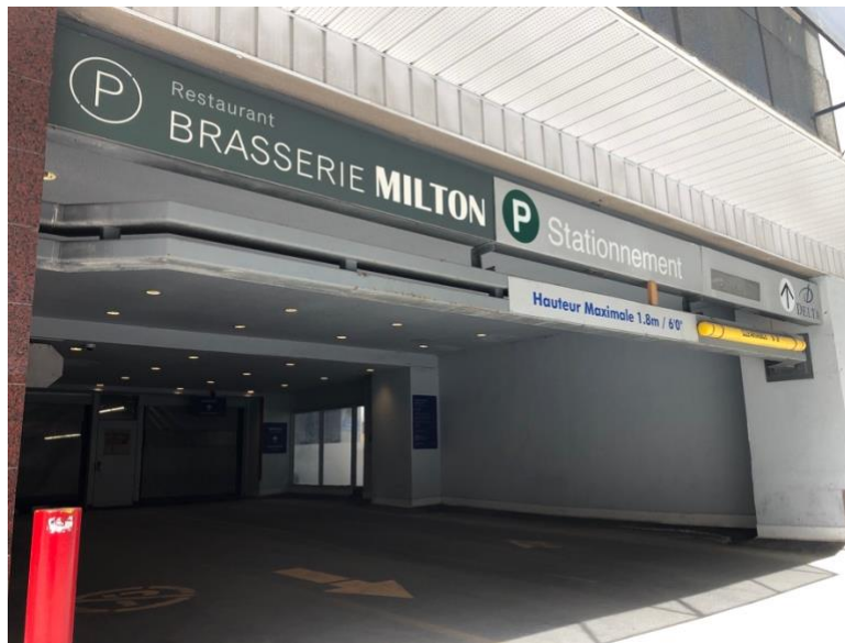
Illustration 9 - Hotel parking

Charging stations for electric cars are available.