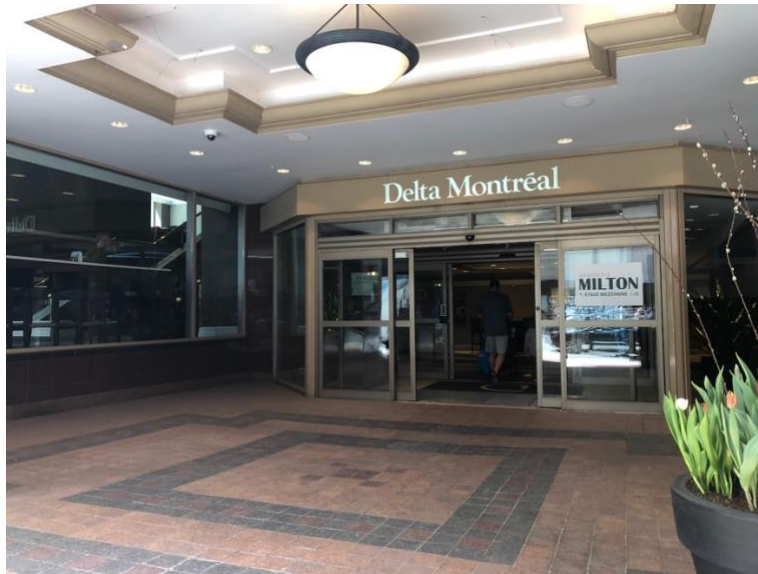
Illustration 11 - Main entrance of the hotel

The carpet in the entrance is not too thick. The indication of the check-in counter is clear.