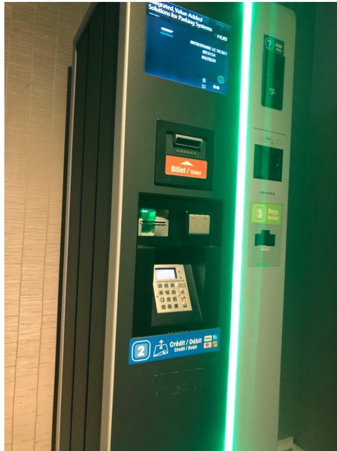
Illustration 10 - Payment terminal in the hotel car park