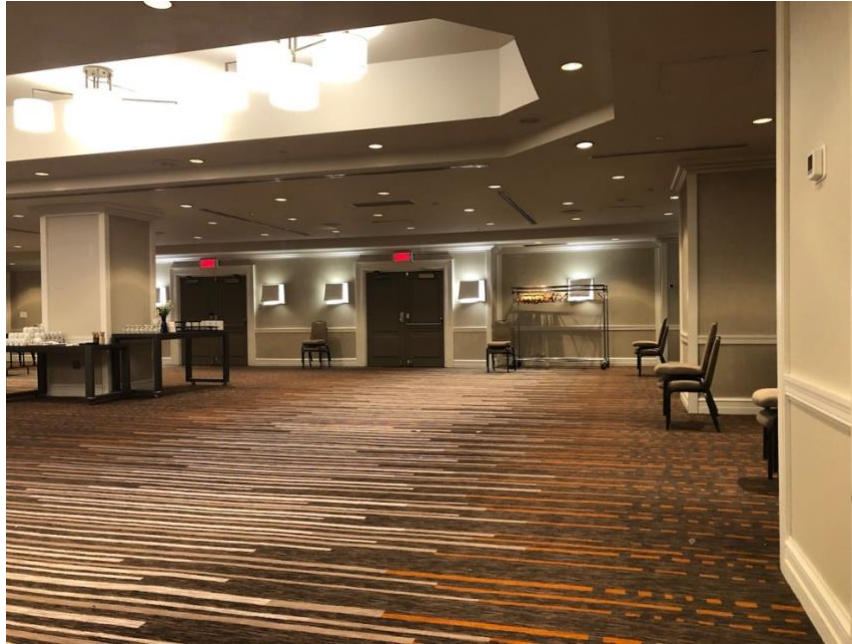
Illustration 18 - Great Hall Opus 1