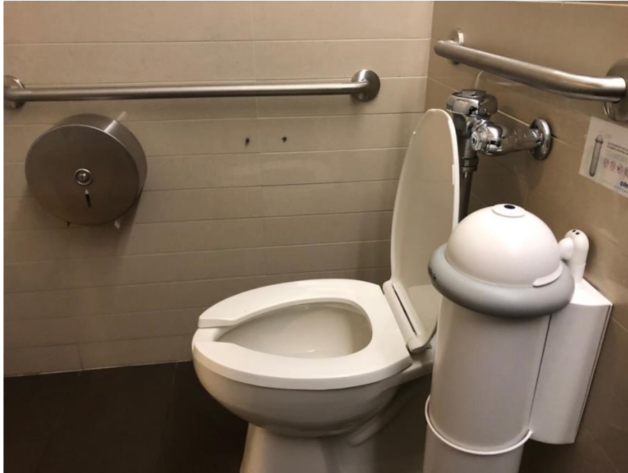
Illustration 22 - Accessible washroom interior

There are transfer bars. The door contains a manual latch and a closing handle. There is a coat rack inside the accessible washroom.