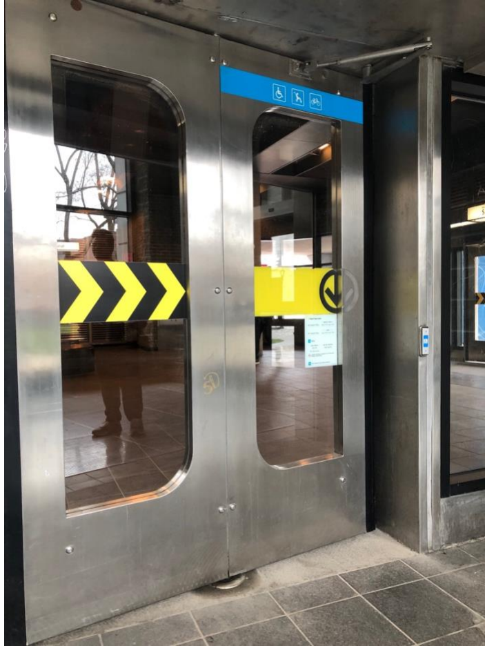
Illustration 5 - Metro doors, with wheelchair indication