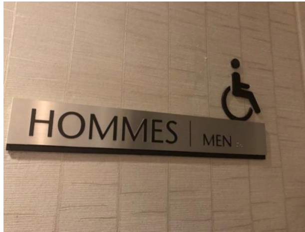
Illustration 20 - Men's accessible washrooms

Toilets are indicated in the corridor and in front of the doors by means of an accessible logo and the text "HOMMES" (MEN) and "FEMMES" (WOMEN) in raised characters and Braille.