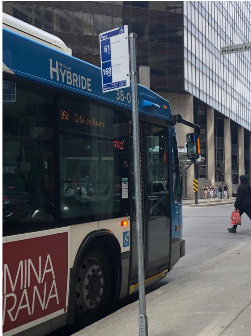
Illustration 3 - Front of a bus at a stop