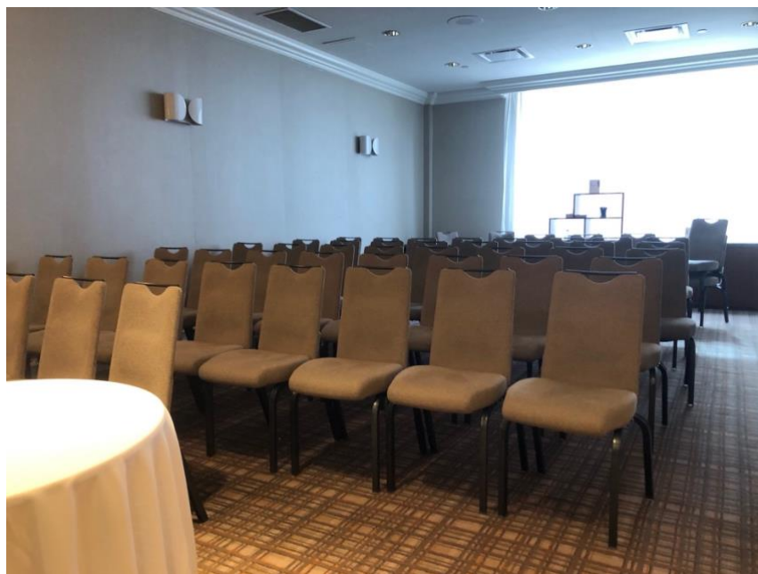
Illustration 19 - Small Vivaldi room with conference room

There are electrical outlets in all rooms. All seats are removable and can be rearranged/removed as needed.