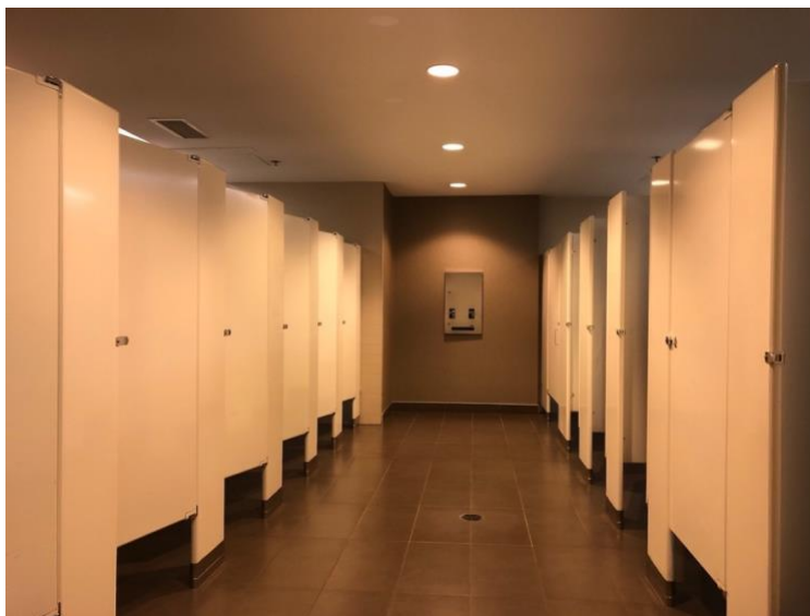
Illustration 21 - Toilets with several cubicles

There is an automatic door opening button in front of each entrance. Each toilet contains several toilet stalls, one of which is accessible.