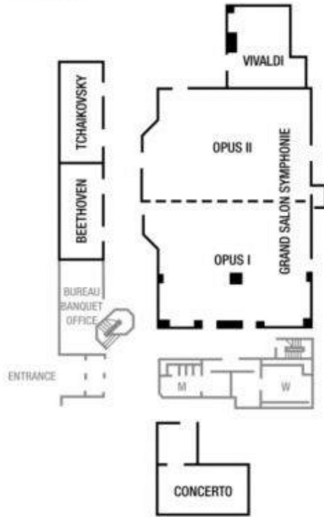
Illustration 16 - Floor plan of the rooms on level M (Mezzanine)