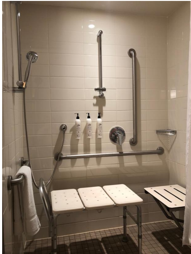
Illustration 14 - Adapted shower in an accessible room

If you have booked an accessible room in the hotel, it is best to give them details about your needs before you arrive. The bathrooms have different types of equipment (bathtub or shower, with or without transfer seat), some beds can be raised, some rooms have audio loops for people using hearing aids.