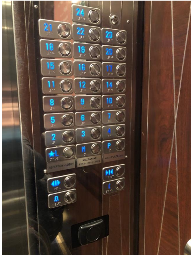
Illustration 13 - Elevator buttons

The buttons on the elevators that go up to the rooms and the convention center have raised characters and Braille, and are illuminated. You must present your room card on the reader inside the elevator to activate the floor selection. The floors are announced verbally.