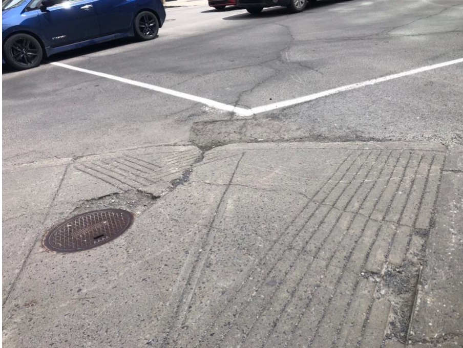
Illustration 2 - Sidewalk accesses are sometimes in poor condition