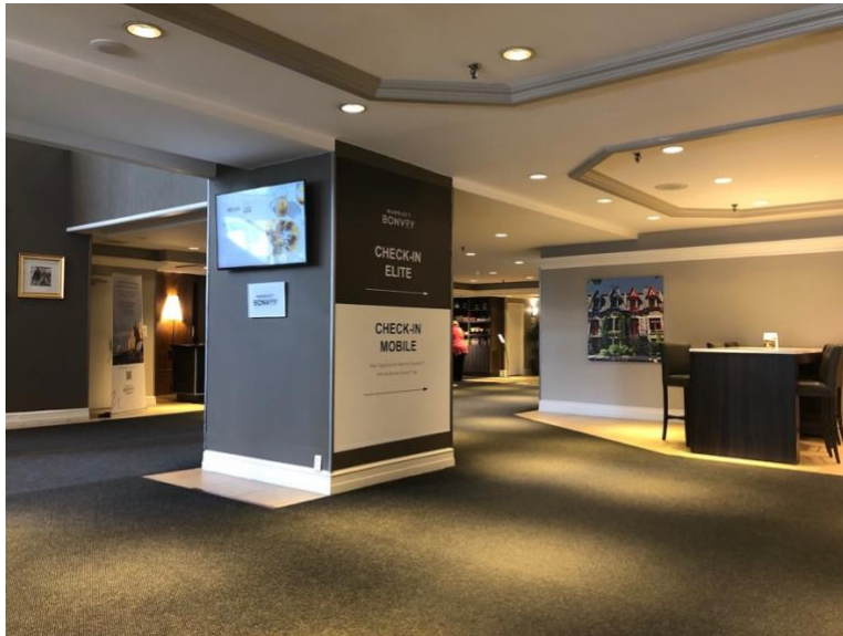
Illustration 12 - Hotel lobby

The carpet in the entrance is not too thick. The indication of the check-in counter is clear.